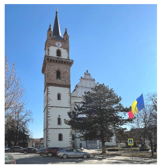
Fig. 2. The Evangelical Church.

The Evangelical Church , in fact "an architectural monument, built in the 14<sup>th</sup> - 15<sup>th</sup> centuries in the Gothic style and modified in the 16<sup>th</sup> century, in the Renaissance style, by the Italian architect Petrus Italus de Lugano" (P. Cocean, C. N. Boṭan, Oana-Ramona Ilovan, 2011, p. 133), to which the Roman Catholic church is added. They all add up to a treasure trove remarkable for their age, specific styles, paintings and well-preserved material objects.