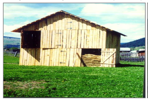
Solution for ensuring the quality of hav (HAYLOFT)