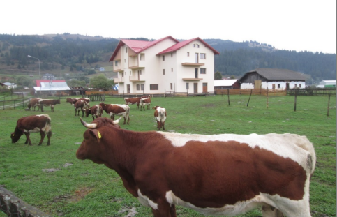
Cattle breeds – adapted to the mountain area (eg. Pinzgau) - Vatra Dornei