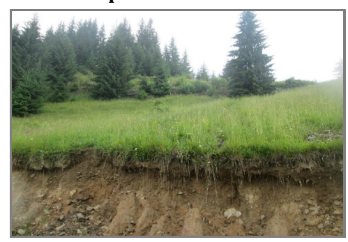
The fertile soil layer (10-15 cm)

• A supplement to the Law on agricultural cooperatives with the inclusion of mountain agricultural cooperatives focused on capitalizing on "mountain products", through which to grant "start-up aid", special tax facilities, gradual according to natural conditions (altitude, isolation, etc.) and "quality premiums", with a compensatory role for the very difficult working conditions in the mountain animal husbandry, with possible production lower compared to the areas with high fertility lands.