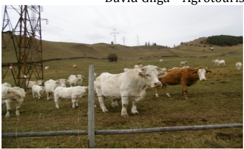
Family farm: Mihai Cornişag; slaughterhouse + meat processing point (Pojorâta, SV)