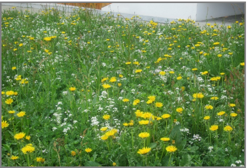
Proper use of organic fertilizer (manure) The valuable mountain natural polyflora