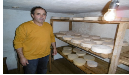
Țarcă Simion Isolated farm, Călimani Mountains Șaru Dornei (SV)