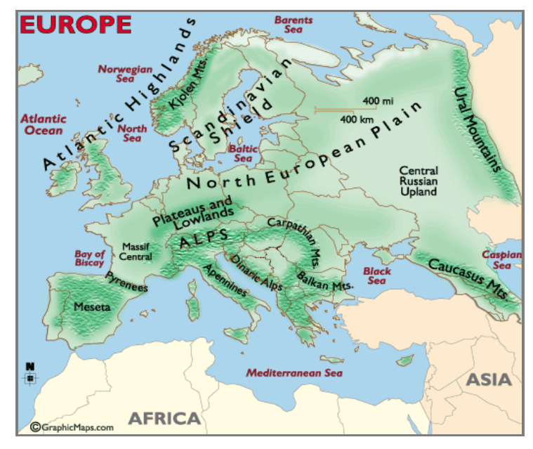
Map with the main European mountain ranges

The following were taken into account, comparatively: spatial size, proportions of mountain areas, some national findings, the mountain population and its proportion in each country as a whole, and aspects that reflect the importance of mountain areas.