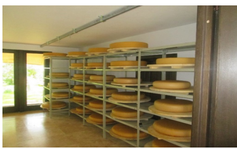
CHEESEMAKING WORKSHOP – CRISTI ȚĂRANU, ȘARU DORNEI (EMENTHAL – SWISS CHEESE) (PRIVATE) – AUGUST 2019