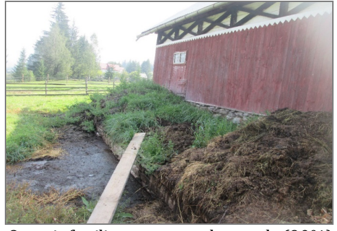
Organic fertilizer – managed wrongly (90%)