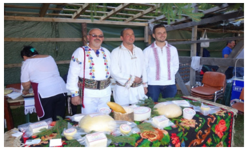
AGRICULTURAL MOUNTAIN COOPERATIVE ("PILOT") SÂNGIORZ-BĂI (BISTRIȚA-NĂSĂUD county) – AUGUST 2019