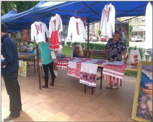
Fig. 3. The 2015 craftsman fair – Beiuș