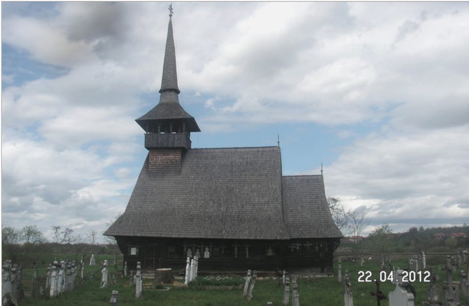
Fig. 4. The wooden church in Rien