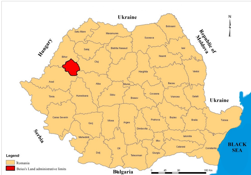
Fig. 1. The geographical location of the land of Beiuș in Romania

in the northern region Pădurea Craiului mountain group, Bihor and Vlădeasa to the east and the Codru Moma group to the south and south-east which highlights the beautiful interweaving of two major landforms: the Apuseni Mountains and the Criș Plain.