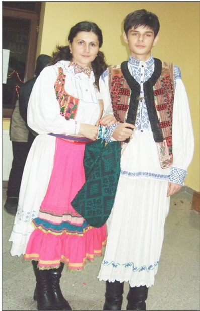
Fig. 2. Traditional costumes of Beiuș Region